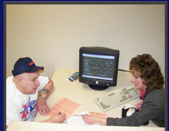
Senior Specialist helping a Lockport senior complete his exemption application.